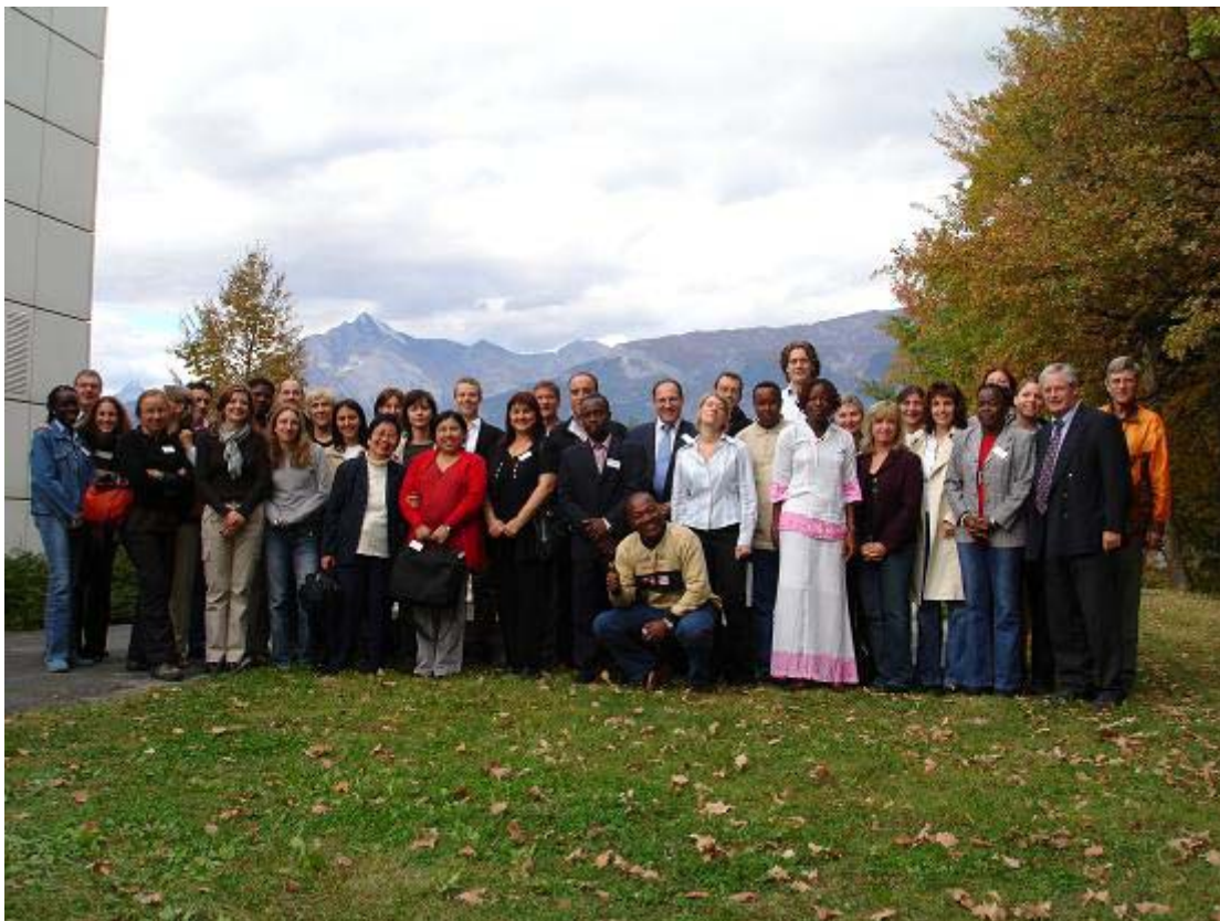
Photo of the seminarists 2005