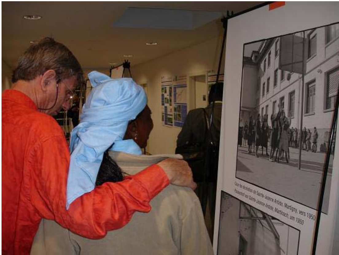
Seminarists visiting the exhibition

The Exhibition's pictures are displayed in the IUKB building, and shows the changes occurred in Education since the 50ies.