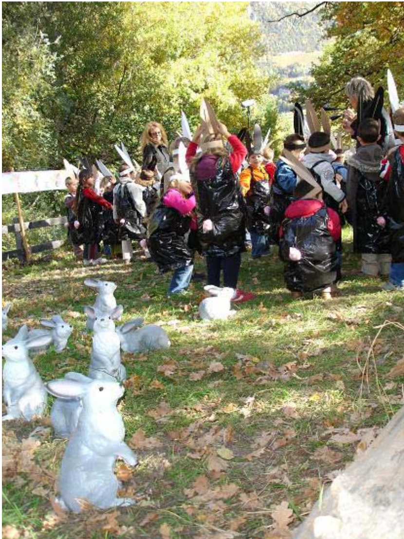
Exhibitions created by childrens of the local primary school of Bramois

The Didactic Path illustrates twelve of the Convention's 54 articles, and stages animals in a symbolic and playful way. Dr Bernard Comby, IDE President, addressed the audience and deplored the precariousness and poverty often depriving children of their basic rights, but stressed the hope given by solidarity and cooperation initiatives.