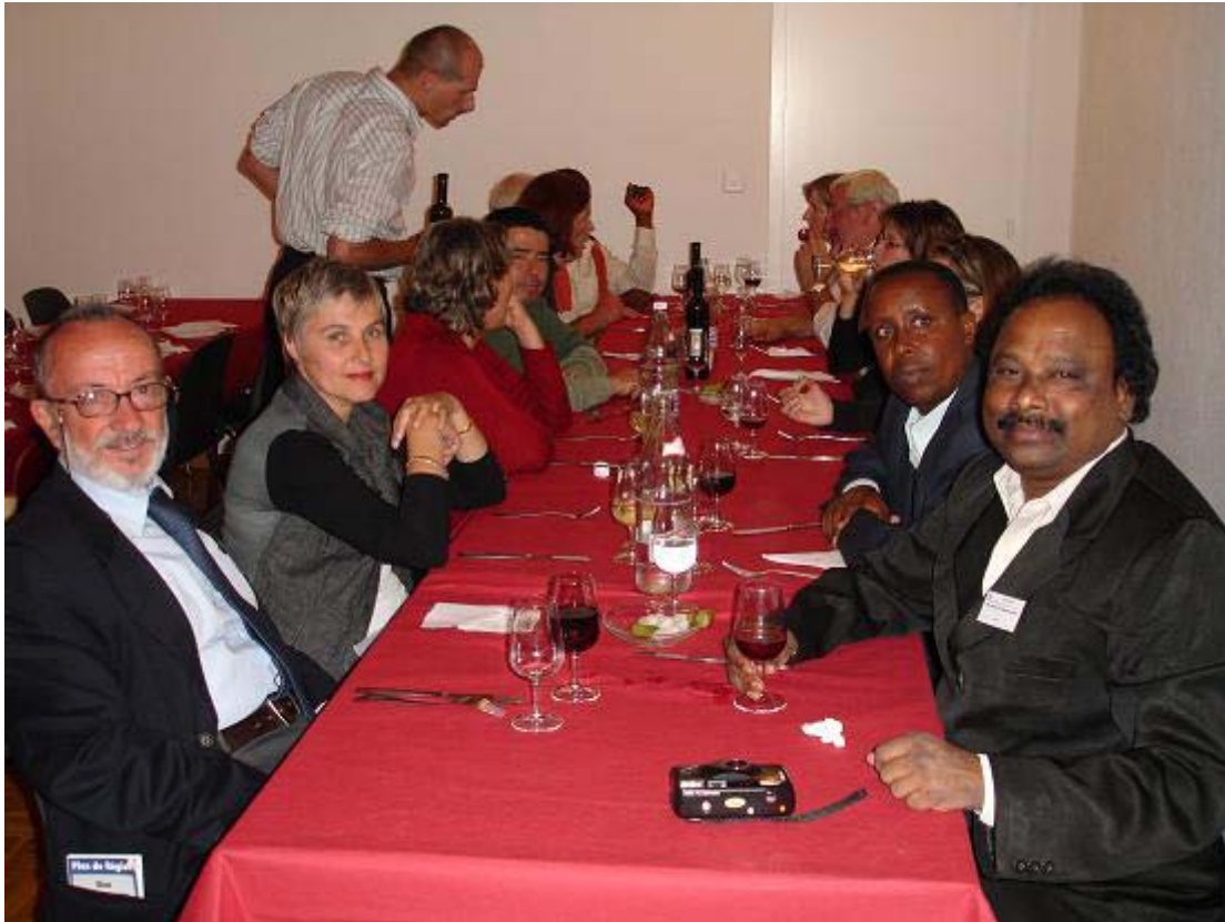
Typical local meal

typical local speciality : the raclette.